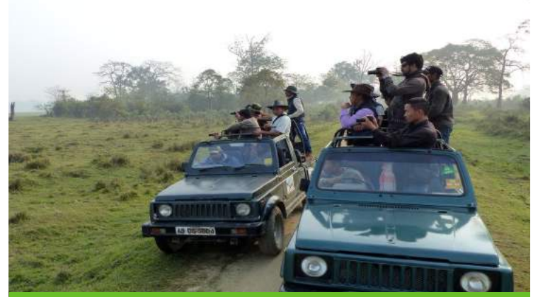
PARTICPANTS ON A JUNGLE SAFARI IN KAZIRANGA NATIONAL ASSAM

INDIA The Energy and Resources Institute (TERI) organized a visit to North-East India where the local communities have been actively involved in conservation and ecotourism. The CCA members visited Khonoma eco-village in Nagaland, where they are protecting grey-bellied tragopan (Tragopan blythii). They toured Pakke Tiger Reserve in Arunachal Pradesh, where local communities are conserving four hornbill species and have formed the Ghora Abhe Society to promote ecotourism. The members were thrilled to see hornbills (revered by their forefathers but almost extinct in Nagaland) in Pakke Tiger Reserve. Members also went to Nameri National Park and Kaziranga National Park (UNESCO World Heritage Sites) where they created rescue rehabilitation centers for the endangered pygmy hog. After the visit, the members decided to replicate some of the conservation activities in their CCA areas as well. Lastly, the Tizu Valley has been shortlisted for the Fourth India Biodiversity Awards, initiated by the Ministry of Environment, Forest and Climate Change. This award recognizes communities who played an outstanding and innovative role in conserving India's rich ecological heritage.