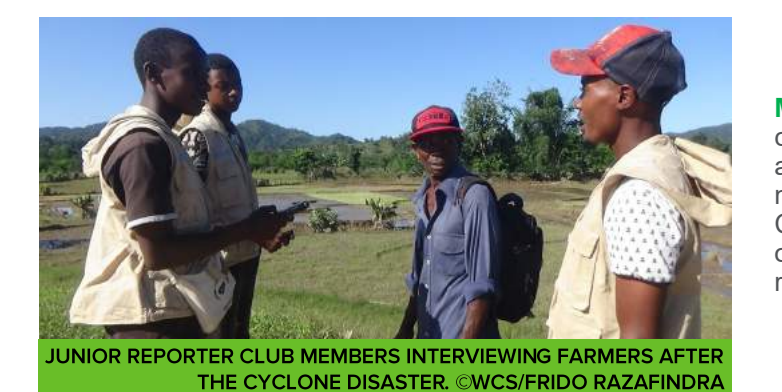
MADAGASCAR Wildlife Conservation Society (WCS) conducted 15 patrols in Makira Natural Park in the forest corridors under restoration. They detected and recorded illicit human installations, illegal camps, forest clearings, and lemur traps. Six active lemur traps were found and destroyed to ensure the safety of lemurs and other animals. One year after Cyclone Enawo, another cyclone struck the region causing serious floods. Junior Reporter Club members went to the village areas to inspect damages. They conducted interviews of the local people's opinion on the frequent occurrence of cyclones and floods in the region. Reports were broadcasted on the local radio station.

SEYCHELLES <u>Green Islands Foundation (GIF)</u> began consultations with fishers, and presented the results of data collected from the year's monitoring at seven landing sites (by GIF staff, fishers and fish vendors). The focus of discussion was adopted procedures to reduce the impact of artisanal fishery on the IUCN Red List of Threatened Species. GIF invited the fishers and the Fishers' Association representatives to the Fishers National Meeting in May 2018. The Threatened Species Project has been featured in the local newspaper and on Seychelles National Public Broadcasting.