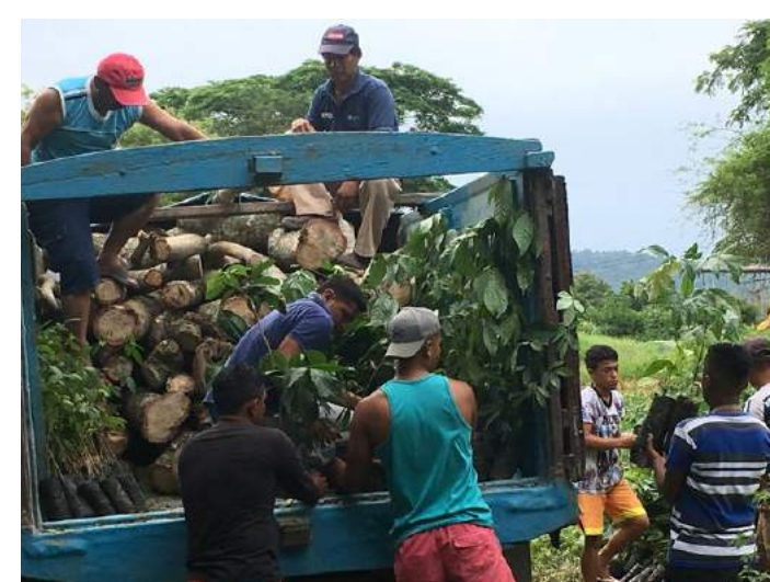
REFORESTATION IN CORDILLERA DEL BALSAMO, YOUTH FROM COMMUNE LAS GILCES ENDOWED VEGETAL MATERIAL FOR THE REFORESTATION PROJECT.

ECUADOR Fundación para la Investigación y Desarrollo Social (FIDES) carried out reforestation efforts in Cordillera El Bálsamo to recover forest biodiversity and to plant food for the Capuchin monkey (Cebus macrocephalus). A total of 1,402 species were planted, such as Guayacán (Tabebuia chrysantha), Seca carob tree (Prosopis juliflora), and Guabas (Inga edulis). Promotion and tourist development increased in the estuaries of the Chone and Portoviejo Rivers. FIDES coordinated with the Manabí Autonomous Decentralized Government (GAD Manabí) to produce four promotional videos of the working areas. The videos highlight the gastronomic wealth and the existing ecological trails in the two areas. Videos were aired on local TV channels and social media outlets, which increased tourism, especially in the communities of San Jacinto and Las Gilces. FIDES also worked with communities to improve the tourist infrastructure and the security around these rivers.